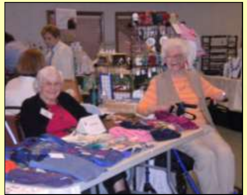
Craft Table at Bazaar