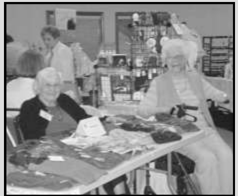
Craft Table at Bazaar