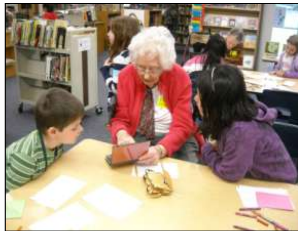
Mooberry Pen Pals meet in person for the first time