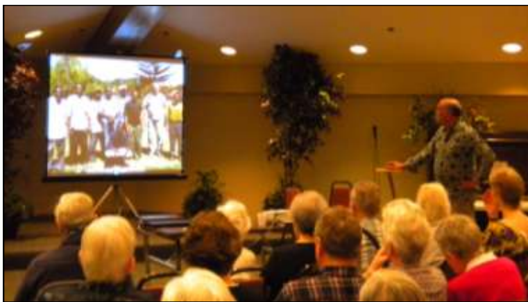
Travelogue: Rwanda in Recovery