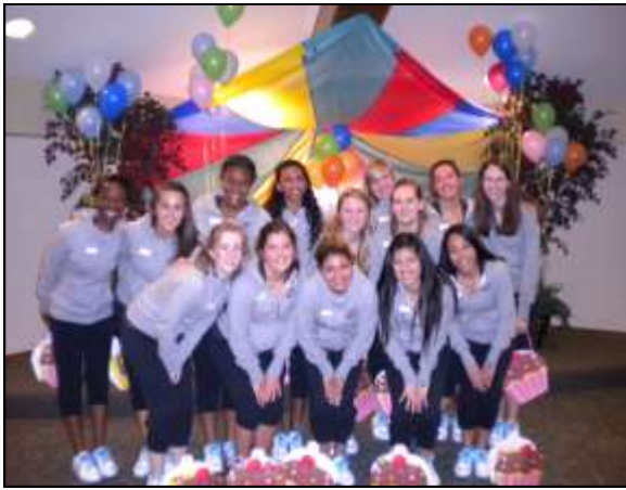
2011 Portland Rose Festival Court Visits Cornell