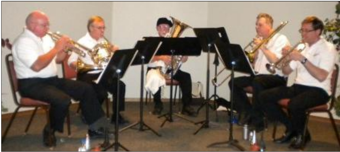
Columbia Foundry Brass Quintet performs Oktoberfest favorites