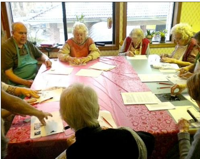
Left: Writing letters to local foster children and local veterans