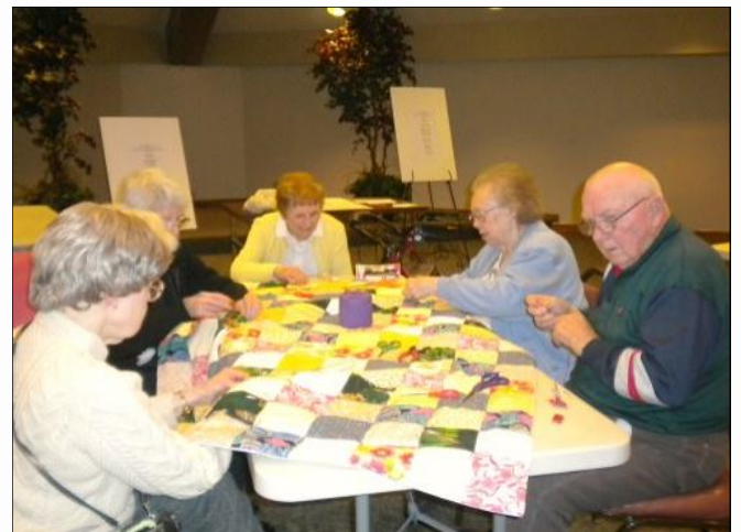
Top Left: Trip to Portland Art Museum