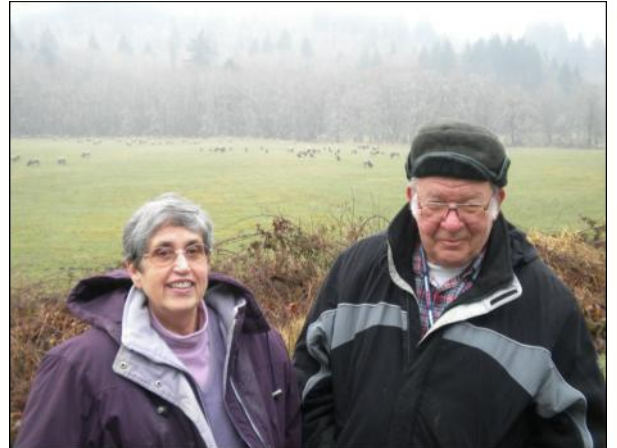
Top Left: Mooberry Classroom Materials Preparation