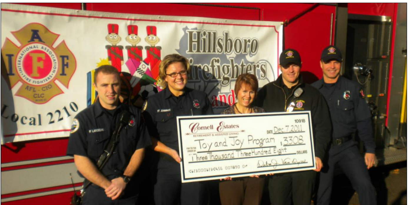
Bottom: Annual Fundraiser raises $3,308 for the Hillsboro Firefighters