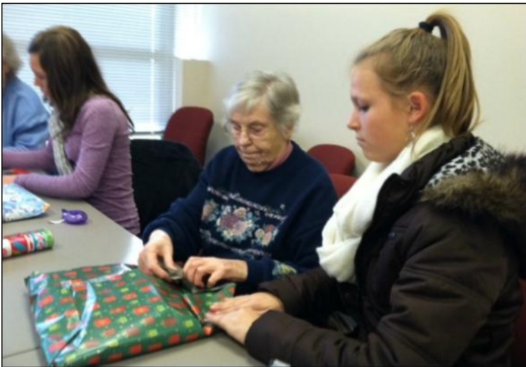
Left: Wrapping Christmas gifts for Foster Kids in Washington County